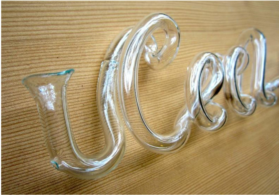
il, verite dans les objets . 26.25" x 3" x 1". borosilicate glass tube; 2013