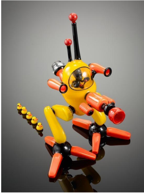
Collaboration by Coyle and Ryno. ATST Ducky Walker . 2013. Borosilicate glass. 14" x 7" x 9"