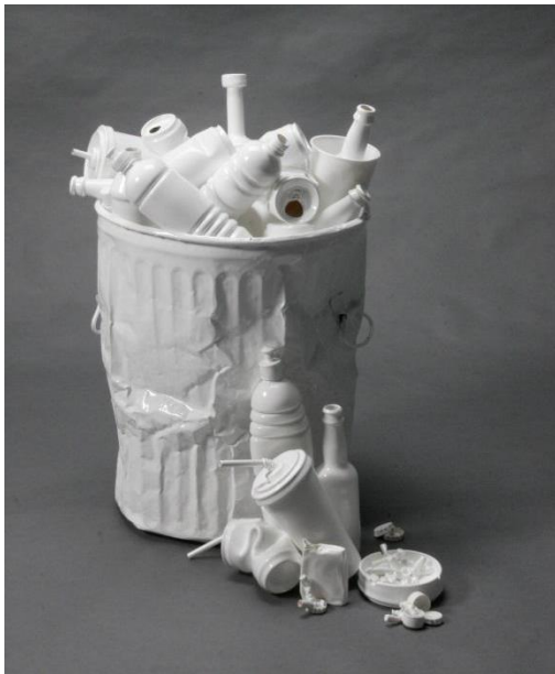
Matt Eskuche. There goes the Neighborhood . 2013 Flameworked and powder coated glass. 65cm x 51cm x 49cm